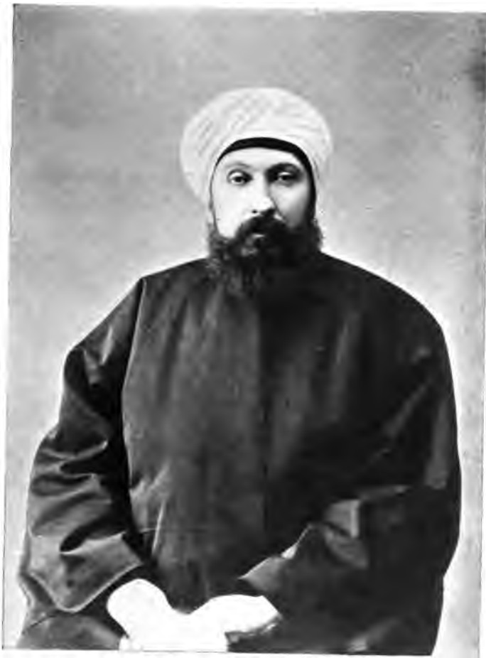
DJEMALLEDDIN EFFENDI (Formerly Sheikh-ul-Islam)